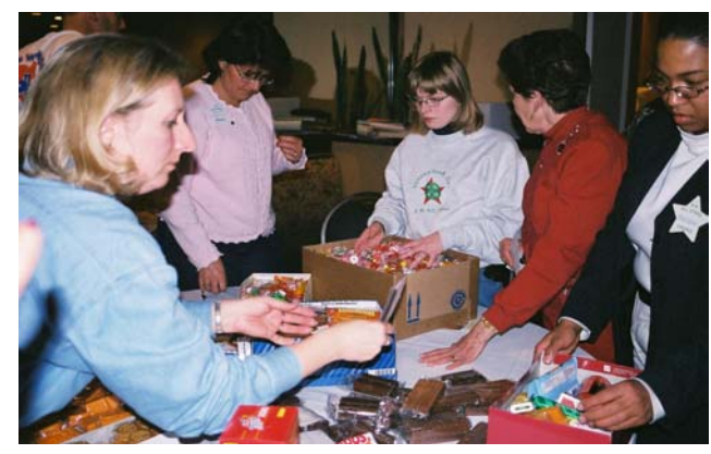
Soldier Care Packages prepared at Mid-Winters. We shipped 20+ packages to our troops. Thanks to all!