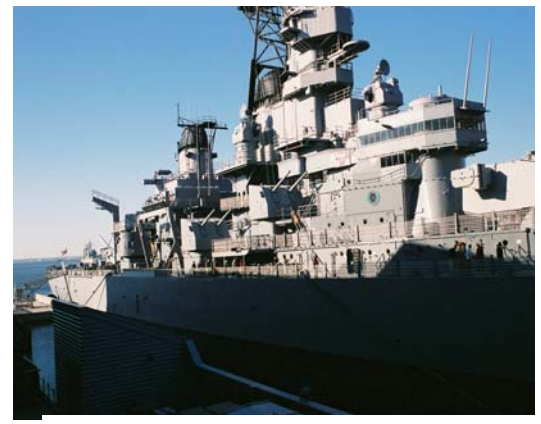
Battleship Wisconsin was toured during Mid-Winters 2005

Charter Seals were awarded to the following Units: Carroll County *** Shenandoah County *** Clarke County *** Frederick County