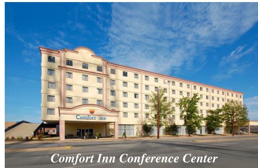
Comfort Inn Conference Center