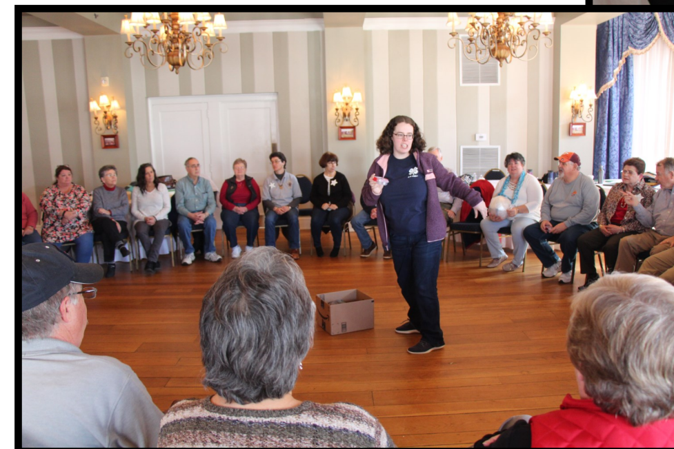
Get Acquainted Activity