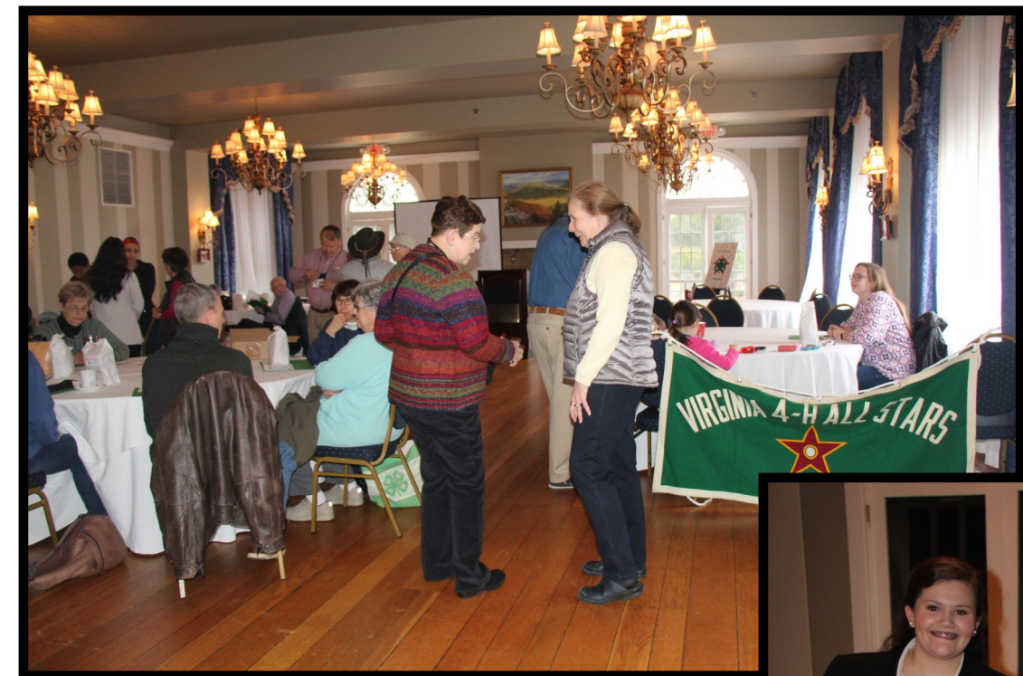
Gathering before the Business Meeting