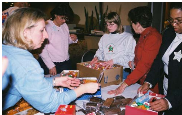
Soldier Care Packages prepared at Mid-Winters. We shipped 20+ packages to our troops. Thanks to all!