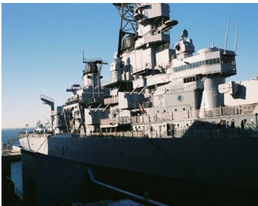
Battleship Wisconsin was toured during Mid-Winters 2005

Carroll County *** Shenandoah County *** Clarke County *** Frederick County