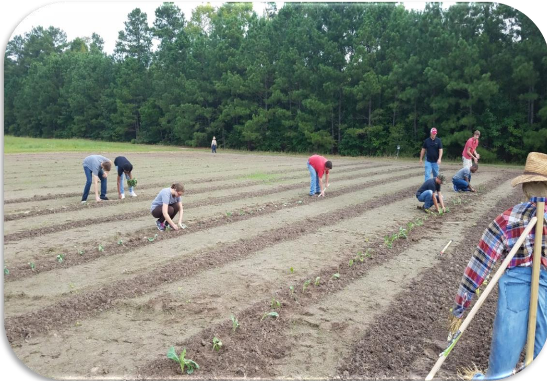
Planting the Fall Garden