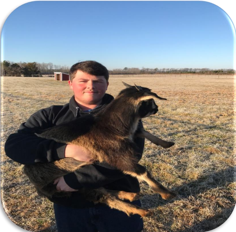
Sometimes Goats Need a Hug