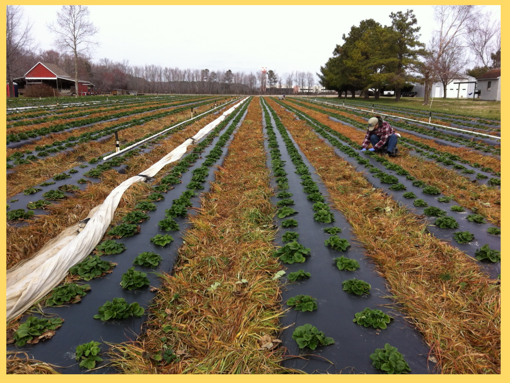
Virginia Beach, VA, 25 Feb., 2013