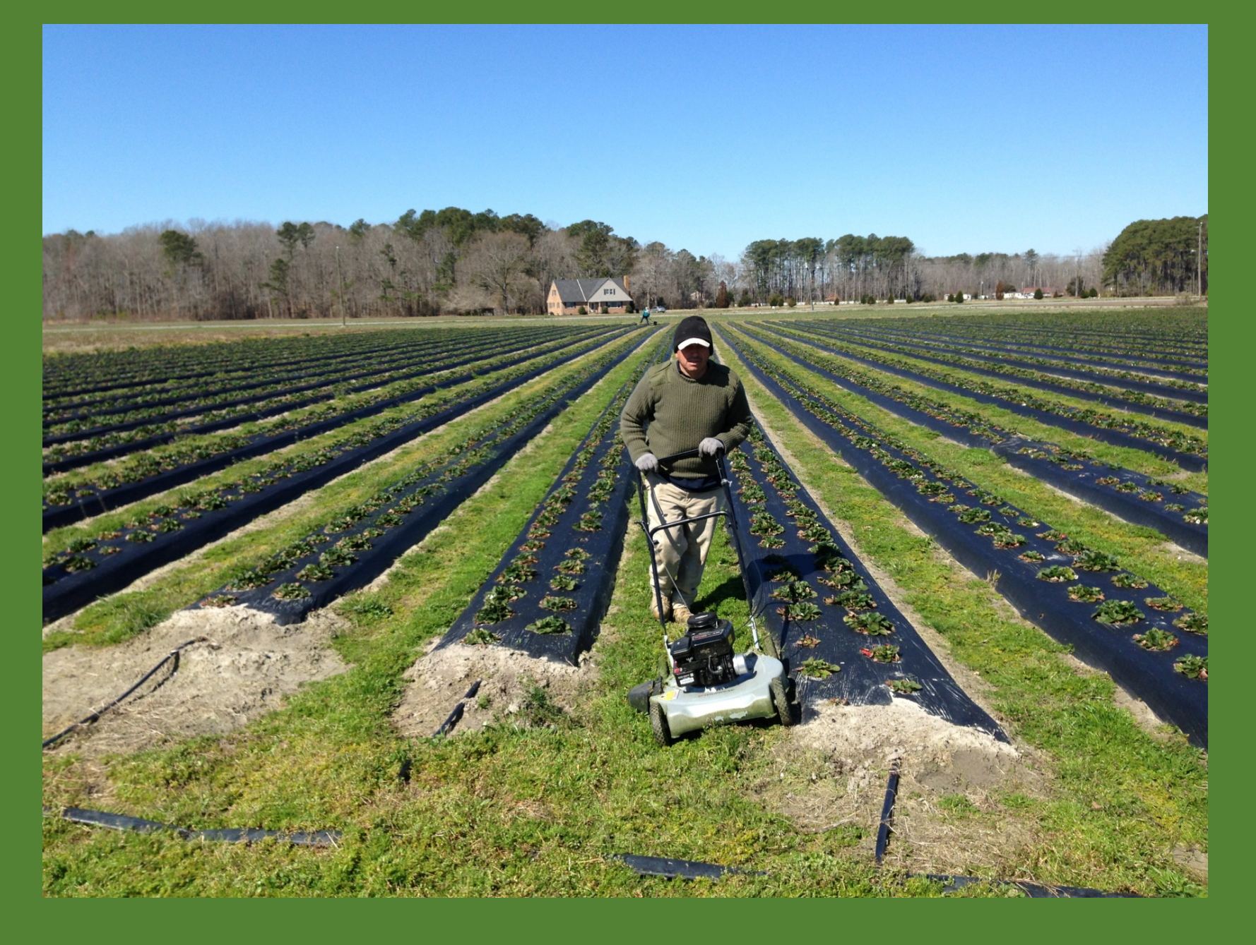
Virginia Beach, 22 March 2013