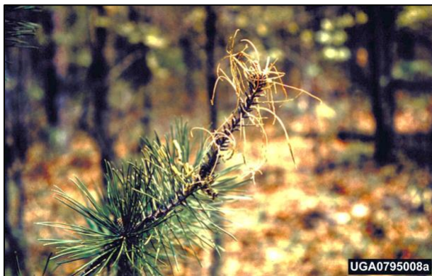
Figure 1. Damage by Virginia pine sawfly larvae.

The Virginia pine sawfly was not considered an important defoliator pest until an outbreak in the late 1950s swept over more than 5.6 million hectares of pine and pine-hardwood forests in Maryland, Virginia, and North Carolina. Tree mortality was only scattered, but growth loss was severe. Heavy defoliation by Virginia pine sawfly for two or more years can weaken trees and make them more susceptible to other mortality agents.