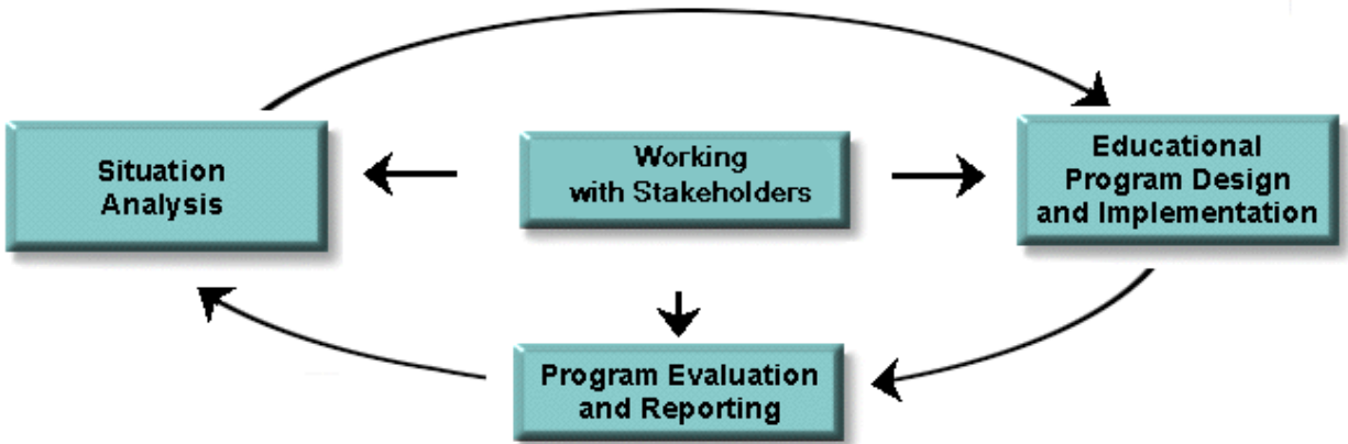
Figure 2. VCE's Program Planning Process Model.

The TELI planning team used the VCE Program Design and Implementation Module (Lambur 2019) and the VCE Program Planning Process Model (fig. 2) for guidance.