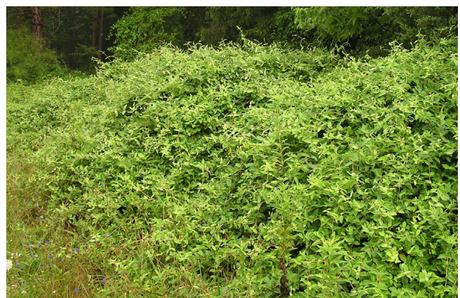
Japanese honeysuckle form on ground