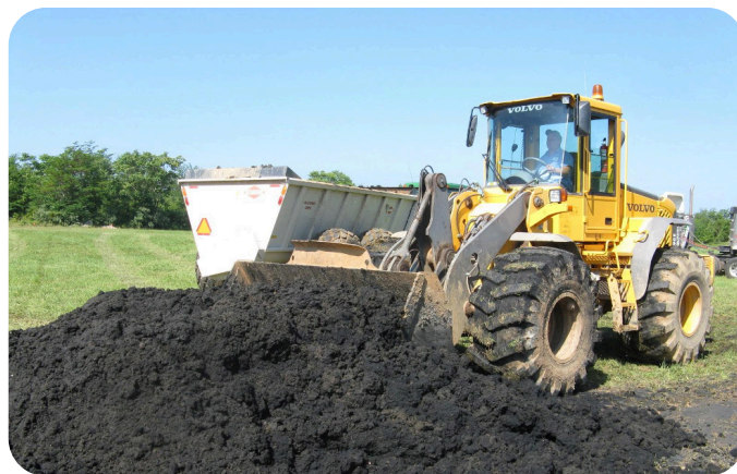
Figure 5. Dewatered biosolids being loaded into manure-type spreader for application.

Biosolids, even when properly treated, will have odors. Under unfavorable weather conditions, the odors may be objectionable, even to rural communities accustomed to the use of animal manure. Odors may be reduced by stabilization process, application method, storage type, climatological conditions, and site selection, as described below.