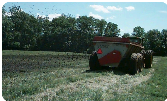
Figure 3b. Dewatered biosolids being spread onto pastureland.