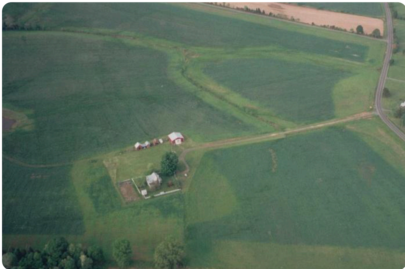
Figure 2. Aerial view of a biosolids-amended farm showing light green, slightly N-deficient buffer areas that received no biosolids to protect sensitive landforms.