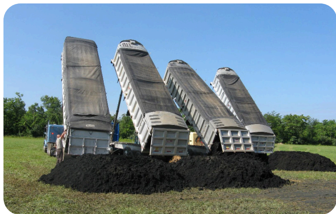
Figure 4. Biosolids being stockpiled at staging area.

Biosolids are typically delivered to the application site by tractor-trailers containing approximately 20 tons ( fig. 4 ), stockpiled at the staging area, and loaded into manure-type spreaders ( fig. 5 ). At a solids content of 15%-25%, 20 tons of wet biosolids is approximately 3-5 dry tons per trailer, or about the amount of biosolids that is normally spread onto 1 acre of land for crops such as corn or hayland. Therefore, there will be considerable truck volume over the course of several weeks for large sites of several hundred acres. Increased traffic on local roads, odors, and dust are potential impacts on the local community that should be addressed by notifying neighbors in public informational meetings or public hearings. Working out delivery schedules that are least likely to be disruptive will minimize the problems caused by biosolids transportation.