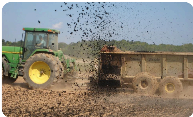
Figure 3a. Dewatered biosolids are spread onto conventionally tilled land.

Dewatered biosolids can be applied to cropland by equipment similar to that used for applying limestone and animal manure (figs. 3a, 3b). Typically, dewatered biosolids will be surface-applied and incorporated by plowing or another form of tillage. Incorporation is not used when applying dewatered biosolids to forages or to crops being grown no-till. Biosolids application methods such as incorporation and injection can be used to meet Part 503 vector attraction reduction requirements.