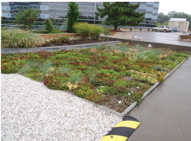
Figure 1. Photograph of vegetated roof. Note that roof contains both intensive and extensive sections.

A vegetated roof (VR) is a best management practice (BMP) that reduces stormwater runoff and pollution. Vegetation and media create a permeable system on a previously impervious surface . The VR intercepts rainfall and filters runoff while reducing the volume and velocity. Vegetated roofs consist of a waterproofing barrier, drainage system, and engineered growing media. There are two types of VRs: intensive and extensive. Intensive vegetated roofs are deeper and heavier, while extensive vegetated roofs are shallower, lighter, and more common (see Figure 1). The type of VR determines the amount of maintenance necessary to maintain the vegetation.