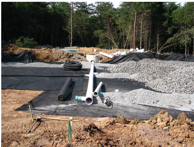
Figure 1. Construction of an infiltration basin.

Infiltration practices provide temporary surface and/or subsurface storage, allowing infiltration of runoff into soils. In practice, an excavated trench is usually filled with gravel or stone media, where runoff is stored in pore spaces or voids between the stones (see figure 1). These systems can reduce significant quantities of stormwater by enhancing infiltration, as well as provide filtering and adsorption of pollutants within the stone media and soils. Infiltration practices are part of a group of stormwater treatment practices , also known as best management practices (BMPs)