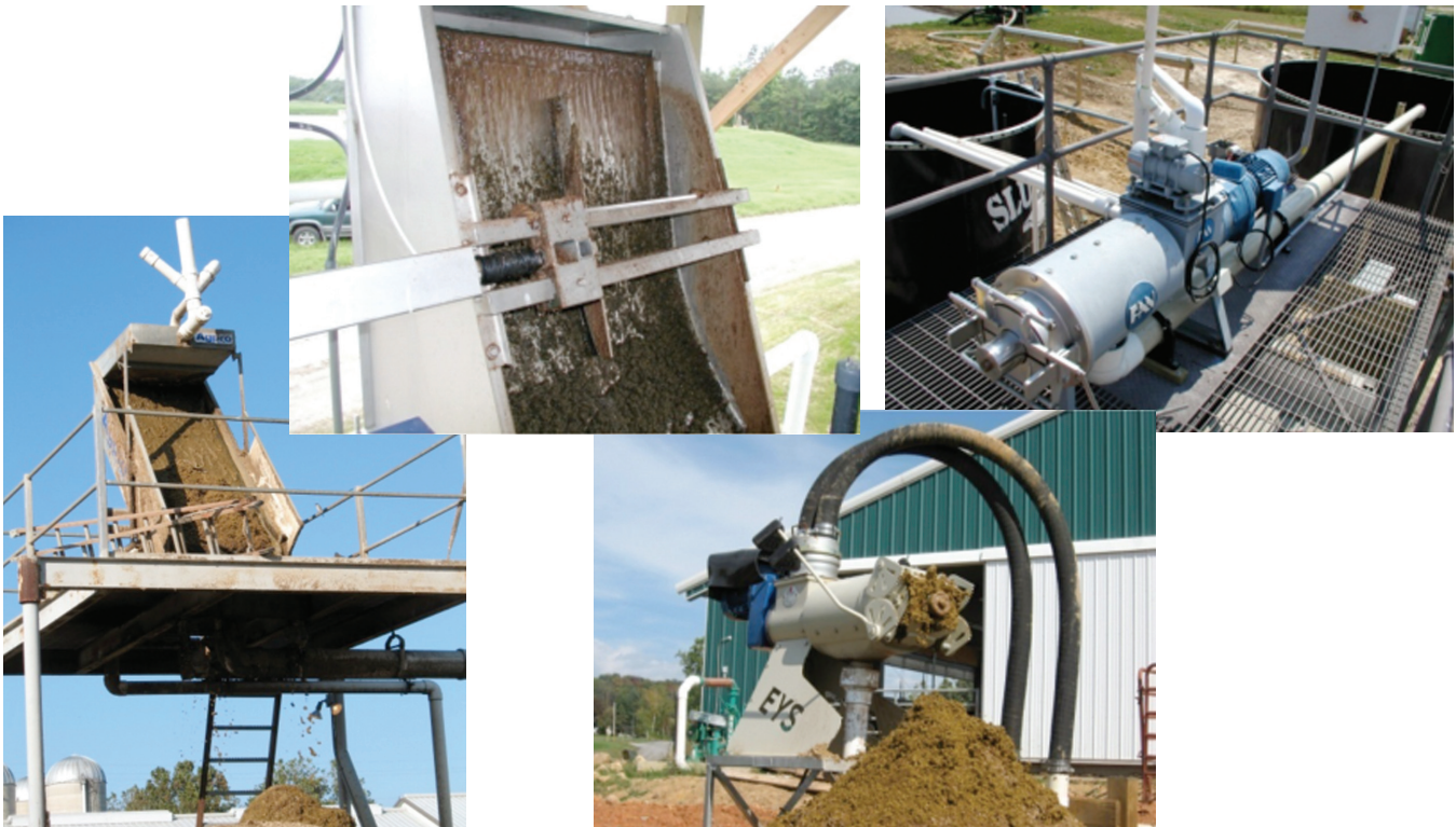
Figure 1. Examples of manure separators used in liquid-manure handling

The treatment of manure or wastewater can happen by or through application of physical forces. Physical processes include those technologies that involve liquid-solids separation and/or the use of heat and pressure. Liquid-solids separation can be achieved through settling (sedimentation) or by using mechanical methods (e.g., use of screens, centrifuges, or belt presses). Advantages of liquid-solids separation include concentration of solids for separate treatment or reuse, reduction of solids that can settle before treating and storing manure in lagoons, and prevention of clogging of manure pipes. In combination with chemicals, liquid