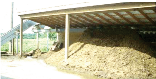
Figure 4. Manure-treatment options showing aerated ponds, lagoons, manure storage tanks, and solid-manure storage structure.