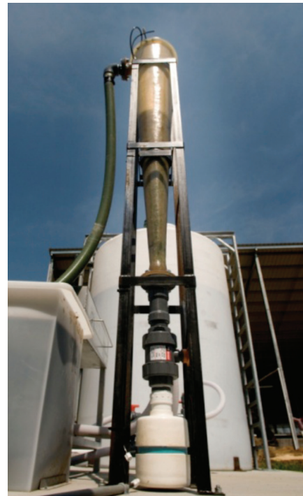
Figure 2. Chemical application to manure in storage tanks for phosphorus removal; struvite recovery reactor from manure to recover phosphorus.