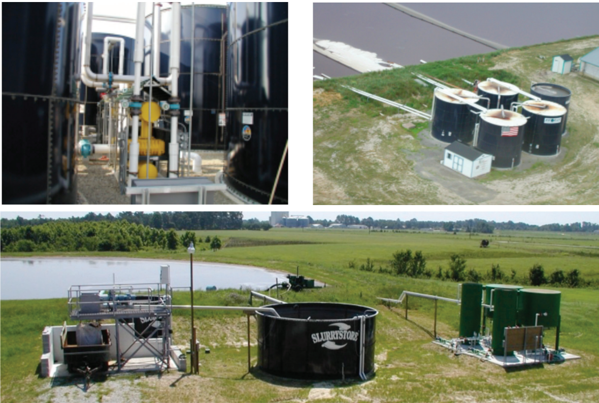
Figure 3. Full-scale manure-treatment technologies on farms using manure separation and aeration.

Anaerobic-treatment processes occur naturally in soils or in engineered systems, such as reactors (digesters) or landfills, in environments where there is no oxygen. The major benefits of anaerobic treatment based processes are reduced COD or BOD and solids; production of methane gas – a potential energy source; less energy required compared to aerobic processes; and less biological-sludge production compared to aerobic processes. Anaerobic digestion does not reduce manure’s nitrogen and phosphorus content, and has the potential of producing odor and corrosive gases.