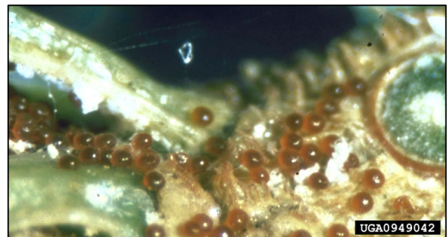
Figure 2. Spruce spider mite eggs at the base of conifer needles.

observed compared to other nearby healthy plants that are green and growing normally. While spruce spider mites are less active during the summer, hot, dry weather predisposes trees to attack by the mites when cooler weather returns.