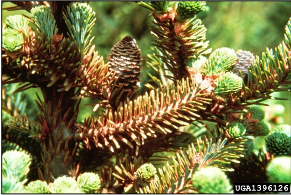
Figure 3. Needles damaged by spruce spider mite.