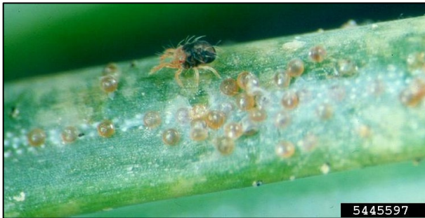
Figure 1. Spruce spider mite beside numerous eggs (Ward Strong, BC Ministry of Forests, Bugwood.org).

Spider mites (Family Tetranychidae; Order Acari) are not insects; they are more closely related to spiders, harvestmen (also called “daddy longlegs”), and ticks. The spruce spider mite, Oligonychus unguis (Jacobi) (Fig. 1), lives in all areas of Virginia and is widely distributed throughout the temperate regions of the United States and Canada. This mite attacks spruce, arborvitae, juniper, hemlock, pine, Douglas fir, Fraser fir, and larch, among other conifers.