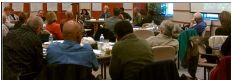
Coalition partners listening to beginning farmers share their start-up experiences at a VBFRCP meeting

There are local banks that make timber, farm real estate and operating loans that beginning farmers should look into. These might be considered “traditional” credit options that reside in rural, local communities. In plain terms, beginning farmers should not rule out these options as possibilities for financing and credit.