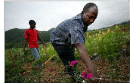
Catawba Sustainability Center garden plots

Marketing is essential to the success of your farm or ranch. There are many marketing avenues one can take. It is also important to assess your potential market and what consumers you are targeting to ensure the longevity of your agricultural business. These and other resource providers can help you with your marketing needs and issues in a variety of ways and in specific locations. Visit their descriptions in the first part of the resource directory, and the websites below, to learn more.