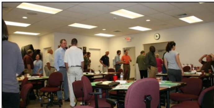
Service professionals taking a break at a VBFRCP meeting in Harrisonburg, Virginia (meeting space courtesy of Farm Credit)