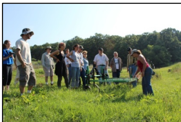
Farm tour in Floyd County, Virginia