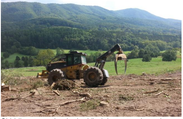
Skidding operation in the Virginia mountain region.

Sustainable forestry is practiced across the Commonwealth of Virginia. Recent data indicates that in Virginia the volume of wood harvested is less than half of the total annual growth (VDOF 2016). While some of the general public may view forest harvesting as a negative environmental impact, forestry is one of the most sustainable and beneficial industries in the country. Forest management, including timber harvesting operations, provide benefits to our communities, including jobs, wood products, recreational value and water quality protection. Active management of the forest also benefits wildlife, improves forest health and provides protection to the waters of the U.S.