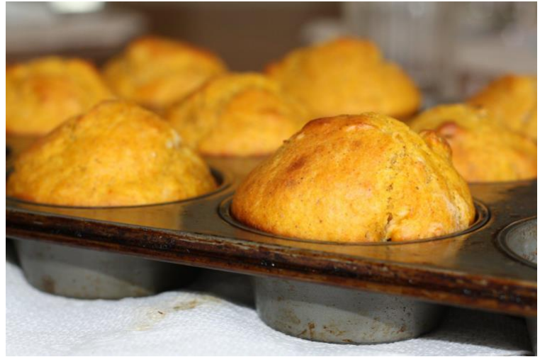
Figure 10. Muffins in a pan. (This photo by Unknown Author is licensed under CC BY)

These products cannot be sold wholesale/sold to other businesses (i.e., grocery stores) for resale, on the internet, or across state lines.