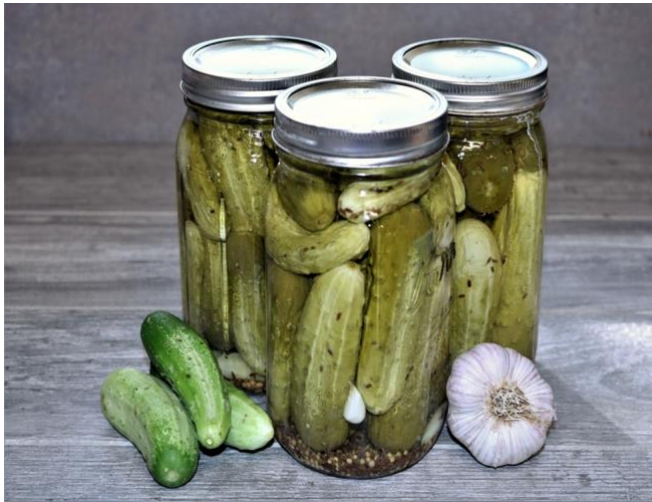
Figure 12. Cucumber pickles in a jar.