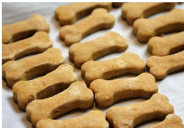
Figure 17. Dog treats on pan.

Pet food/treats can be sold in individual packages or sold in bulk (self-service style) at the farmers market. If the product requires refrigeration, make sure the product is stored in a cooler at 41°F or below and instruct customers to store at those temperatures following the purchase as well. For non-refrigerated products, store in dry containers that you can keep at room temperature.