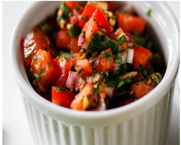
Figure 14. Fresh tomato salsa.

Frozen foods must be kept frozen which is very difficult to maintain without mechanical equipment.