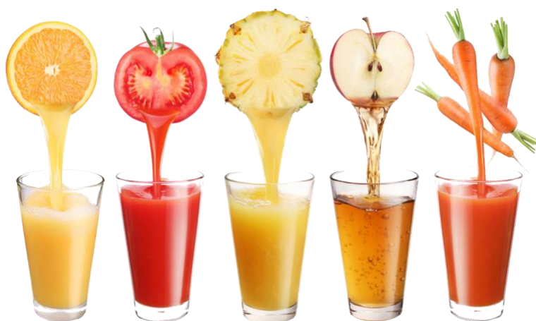
Figure 16. Variety of juices.

Beverage service : To sell juice that is being prepared at the farmers market, you will need to contact VDH.