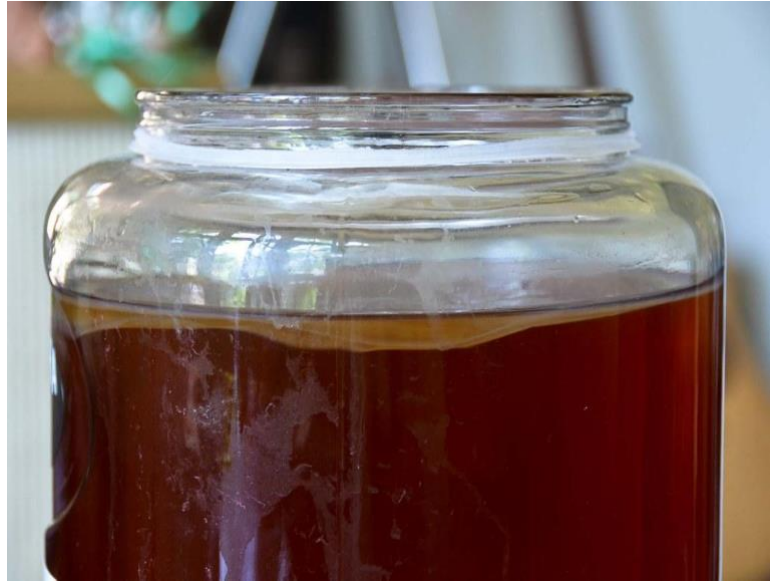
Figure 15. Kombucha with mother.

The only reliable way to confirm that your product has less than 0.5% alcohol is to test it. You should test your finished product at the time of bottling as well as the unpasteurized bottled product after weeks of storage. You may have to limit the time for sale at market (shelf life) if the alcohol content rises above 0.5%. Additionally, if at any time during the production, storage, or sale, your kombucha exceeds 0.5% ABV, you will be subject to alcoholic beverage regulation, regardless of whether you dilute the product prior to sale.