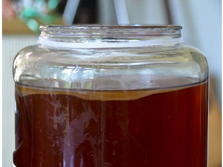
Figure 15. Kombucha with mother.

The only reliable way to confirm that your product has less than 0.5% alcohol is to test it. You should test your finished product at the time of bottling as well as the unpasteurized bottled product after weeks of storage. You may have to limit the time for sale at market (shelf life) if the alcohol content rises above 0.5%. Additionally, if at any time during the production, storage, or sale, your kombucha exceeds 0.5% ABV, you will be subject to alcoholic beverage regulation, regardless of whether you dilute the product prior to sale.