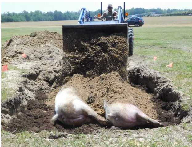
Figure 1. An Above Ground Burial field trial at the Tidewater AREC.

Above Ground Burial (AGB) has been field tested in nine trials in the United States (see Figure 1. Above Ground Burial field trial at the Tidewater AREC).