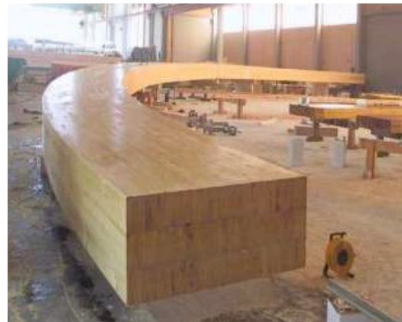
Figure 3: Glulam manufactured to meet curve design.

One of the design advantages of the glulam is the ease of bending into the desired curve shape and into long lengths. Glulam is manufactured by pressing small-length and specific width lumber through finger jointing. It can be set up to bend on the desired curve of any length and dimension for structural use. The ability to produce glulam of the required shape and size provides design flexibility and architectural and aesthetic beauty. The fire resistance of glulam timber is similar to normal wood as glulam acts as a thick wood member. See Figure 4. When the surface is ignited, the fire begins to penetrate the wood quickly. However, as the fire continues and a layer of char forms, the burn rate gradually decreases because the char acts as insulation, and also produces off-gassing that displaces the oxygen.