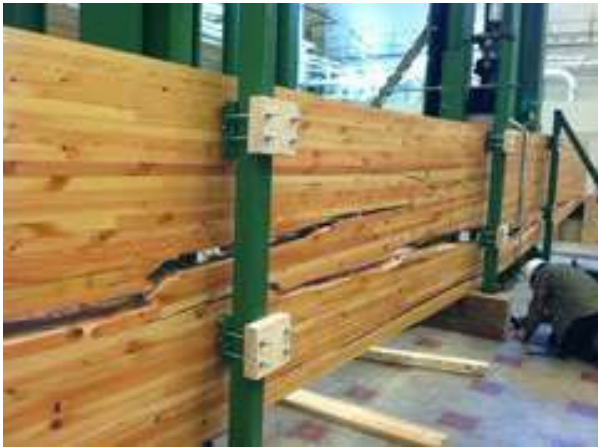
Figure 6: Performance of Glulam under pressure

Glulam boards have better mechanical strength than other wood products and higher resistance to rot and fire.