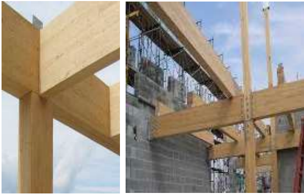
Figure 5: Glulam used as column and beams