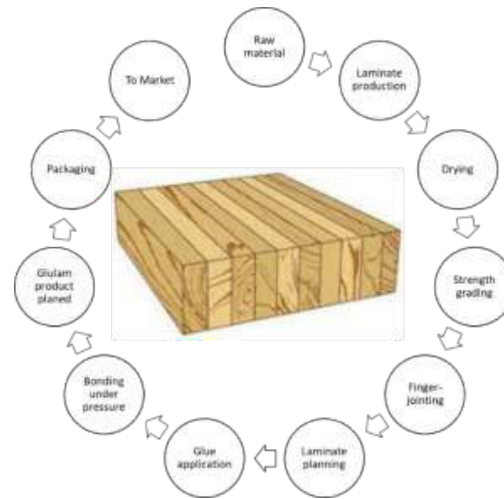
Figure 1: Glulam manufacturing. Adopted from (Swedish Wood, 2021)

Glue-laminated timber or glulam, is an engineered wood product consisting of several parallel layers of small pieces of lumber stacked and glued together under pressure to make a large timber structure (APA, 2019). Glulam is commonly used for structural components like columns, beams, and arches of mid to high-rise buildings. Glulam provides strength, stability, and various length options to facilitate design flexibility. Glulam adds beauty to the exposed structure section, like rafters and ridge beams. However, most of the beams are used as floor beams and headers and are invisible. Stock beams are the common types of glulam readily available in North America. Stock beams are used as floor beams, door or window headers, ridge and rafter beams, and columns.