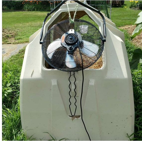
Figure 2. Calf hutch with attached fan.

for calves. Also, try to reduce any other outside stressors such as vaccination or disbudding during the hottest times of the day.