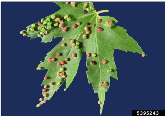
Figure 8. Maple bladder gall mite, Vasates quadripedes Shimer.