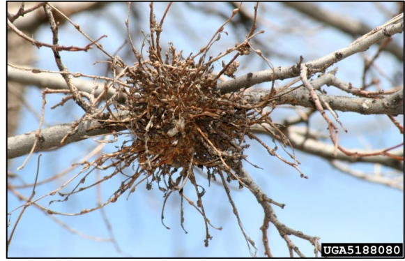
Figure 5. A hackberry witches' broom.

Witches' brooms are messy clusters of dense, deformed twig growth produced by eriophyid mites in association with a plant pathogen (Fig. 5). They can resemble bird nests when small. Witches' brooms can also be produced by other factors, such as pathogens, nutritional deficiencies, or parasitic plants.