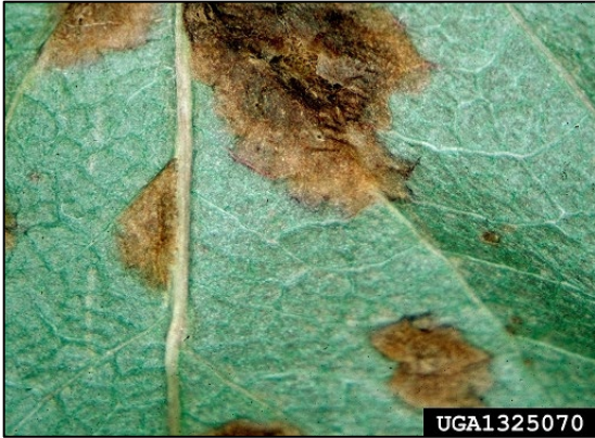
Figure 3. Appleleaf blister mite, Eriophyes mali Nalepa.