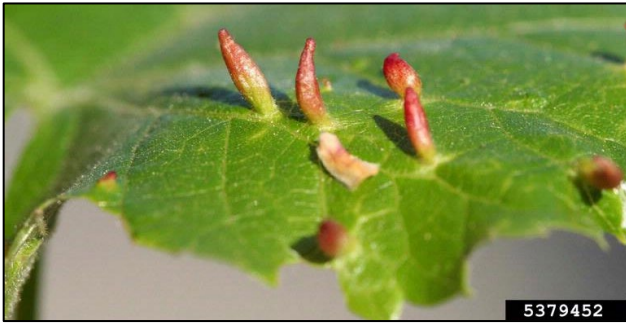
Figure 7. Linden gall mite, Eriophyes tiliae (Pagenstecher) (Milan Zubrik, Forest Research Institute Slovakia, Bugwood.org).