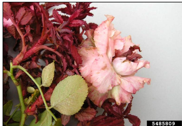
Figure 6. Rose rosette disease.

Rose rosette disease is one example of a witches' broom produced by eriophyid mites that vector a plant virus (Fig. 6). For more information about managing this disfiguring condition in roses, see the VCE factsheet Rose rosette disease .