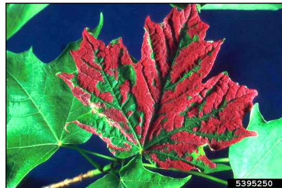
Figure 2. Crimson erineum mite, Aceria elongata (Hodgkiss), on maple.

Erineum growths are dense, velvety patches of fine plant hairs on leaves. Erineum growths on maple are sometimes red (Fig. 2), while those on alder, beech, and poplar are tan or brown. These growths may be mistaken for a foliar disease.