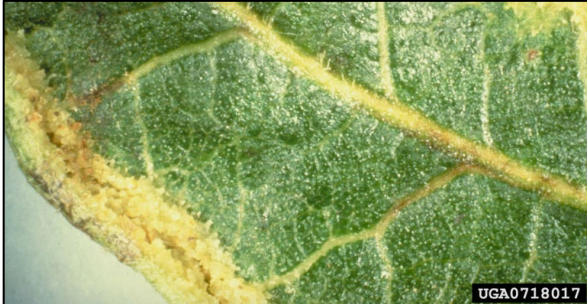
Figure 4. Leaf roll gall made by mites along the lower leaf edge (Eric Day, Virginia Tech, Bugwood.org).

Leaf roll galls can be seen on pecan. The mites live within the narrowly folded, thickened plant tissue along the leaf edges (Fig. 4). The galls cause the edges of the leaf to roll up and turn brown, but this does not usually lead to defoliation and trees outgrow the damage.