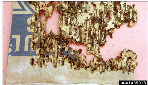
Figure 4. Silverfish damage to cardboard (Clemson University, USDA Cooperative Extension Slide Series, Bugwood.org).

probably not eliminate an infestation. Use an aerosol insecticide with residual activity to help control these pests. Spray all typical hiding places such as in cracks and crevices, in cupboards, and around water pipes. Diatomaceous earth or boric acid powders can be sprinkled in areas where silverfish or firebrats are seen; follow the directions on the labels of these products. Keep pantry items like flours and grains in storage containers with tight lids to avoid contamination by silverfish and other pantry pests.