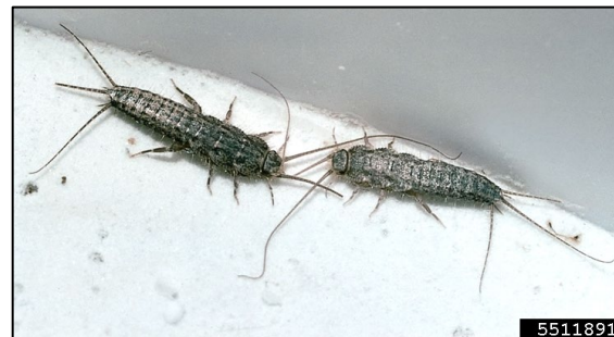
Figure 2. Fourlined silverfish (Kansas Department of Agriculture, Bugwood.org).

survive, but firebrats prefer higher temperatures of 86°F or higher (>30°C). In buildings, firebrats are often found near boilers, furnaces, hot pipes, and other heated areas while silverfish are commonly seen in attics, basements, garages, bathrooms, and other areas with lower temperatures. Both silverfish and firebrats are nocturnal insects that avoid light and run swiftly. Homeowners may not be aware of the presence of these pests until one is found trapped in the bathtub or sink. Outdoors these insects live under rocks and bark; in leaf litter; in caves; or in the nests of birds, mammals, and sometimes the colonies of other insects.