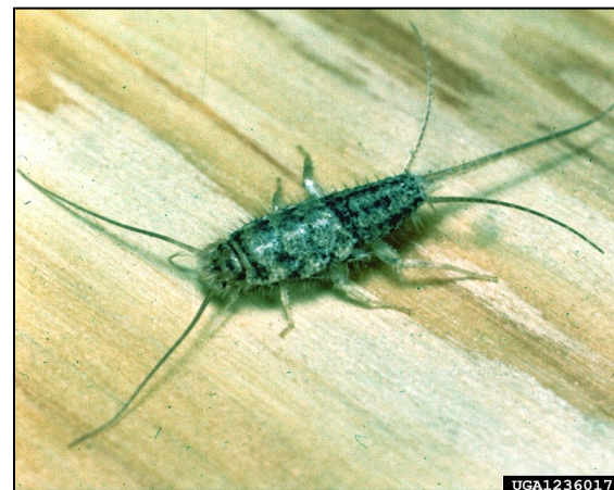
Figure 3. Firebrat (Clemson University, USDA Cooperative Extension Slide Series, Bugwood.org).