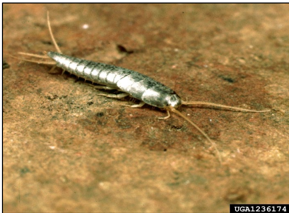
Figure 1. Silverfish.

Silverfish, including firebrats, are soft, flattened insects measuring approximately 0.5-1 inch long (13-25 mm). Many species of silverfish are covered with silvery gray scales (Fig. 1), although others are a darker gray, tan, or have mottled brown markings (Fig. 2). The bodies of silverfish and firebrats are broader at the head and taper towards the tip of the abdomen. They have long antennae and three long filaments extending outward from the tip of the abdomen (Fig. 1-3). Neither silverfish or firebrats have wings. Firebrats have bristly, somewhat stocky bodies with tan and dark brown markings (Fig. 3).