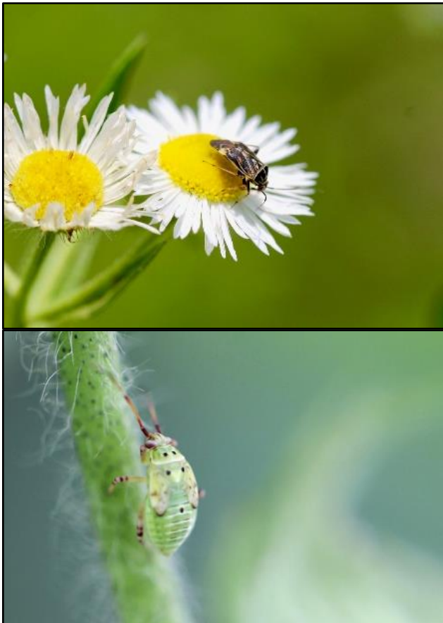
Figure 2. Top: Adult TPB on weedy host daisy fleabane, Erigeron annuus ; Bottom: Fifth instar TPB nymph on cultivated cotton. (Seth Dorman)

Tarnished plant bug adults are approximately 5 to 6 mm in length, 2 to 3 mm in width, and have flat, yellowish-brown bodies with reddish-brown and black mottling, small heads and a long proboscis tucked ventrally at rest (Fig. 2) (Mueller et al. 2003, Greene et al. 2006).