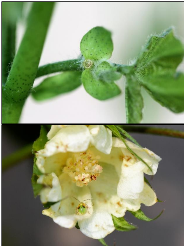
Figure 3. Top: Square/bud abscission in cotton; Bottom: TPB feeding injury to flowering cotton ("dirty bloom") (Seth Dorman)

age fruiting structures simultaneously throughout the growing season (i.e., squares, flowers, bolls) and are therefore more susceptible to economic losses from TPB feeding for longer periods.