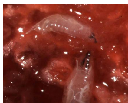
Figures 1-3. Spotted-wing drosophila male showing black spots near wing-tip, serrated ovipositor of female and larvae.