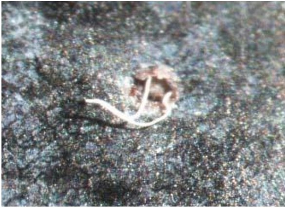
Figure 4. Respiratory filaments on a spotted-wing drosophila egg projecting from an oviposition puncture in a blueberry.