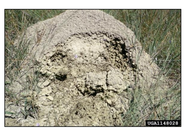
Figure 4. Large fire ant mound in field.

Around the farm, large fire ant mounds can damage agricultural equipment in the field, particularly in areas with heavy soils (Fig. 4). Fire ants may damage irrigation tubing when seeking water sources in dry weather. They are attracted to electrical equipment and may damage it by stripping wires and shorting out circuitry.