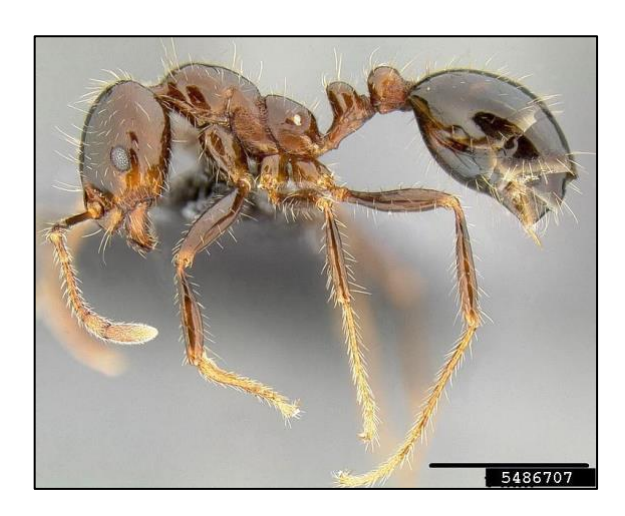
Figure 3. Adult black imported fire ant.