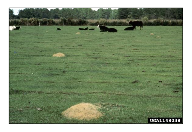
Figure 5. Fire ant mounds in a cattle pasture.

parks, flower beds, cemeteries, and lawns (Fig. 7) that are not heavily shaded. They nest inside houses, buildings, and sometimes vehicles. Fire ants are often found near building foundations (Fig. 8), concrete structures, or rock walls where solar radiation helps keep the colony warm. In addition, fire ants may nest in air conditioners, water pumps, switch boxes, transformers, and other electrical housings.