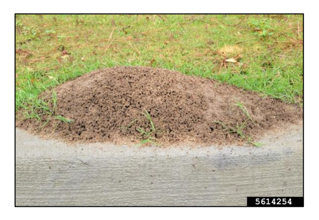
Figure 7. Fire ant mound along a curb.

Imported fire ant colonies do not always form large mounds. Their mounds can range from nearly flat to almost 0.46-0.61 m (18-24") tall. Young colonies may make small mounds until the colony is older with enough larger worker ants to build larger mounds. Soil type can influence mounds as well, with lower or flatter mounds in sandy soil and taller mounds in clay soils. During cold weather, the colony retreats deep in the ground and may not actively enlarge their mound until warmer weather returns.