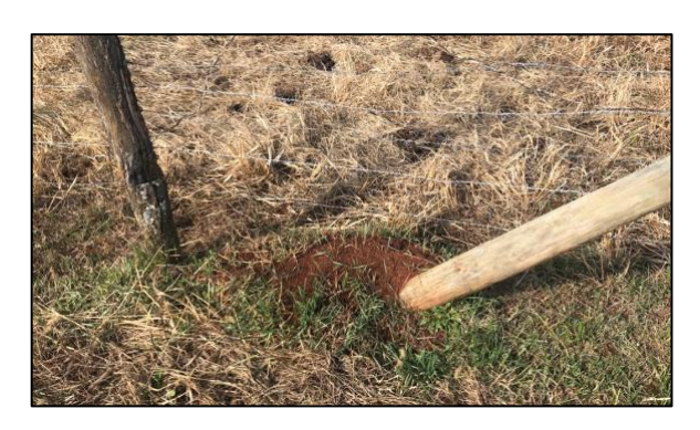
Figure 6. Hybrid fire ant mound at the base of a support pole along a fence in Lee County, VA.

Imported fire ant colonies do not always form large mounds. Their mounds can range from nearly flat to almost 0.46-0.61 m (18-24") tall. Young colonies may make small mounds until the colony is older with enough larger worker ants to build larger mounds. Soil type can influence mounds as well, with lower or flatter mounds in sandy soil and taller mounds in clay soils. During cold weather, the colony retreats deep in the ground and may not actively enlarge their mound until warmer weather returns.