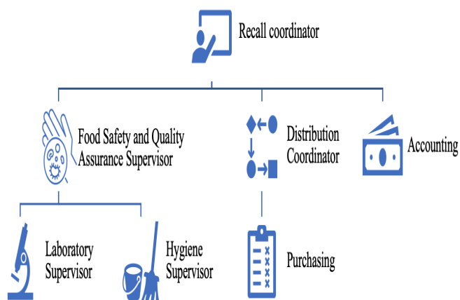
Figure 1. Example of recall team development comprising of individuals from a variety of departments. Figure developed by Claire M. Murphy

www.fda.gov/Safety/Recalls/IndustryGuidance/ucm129334.htm