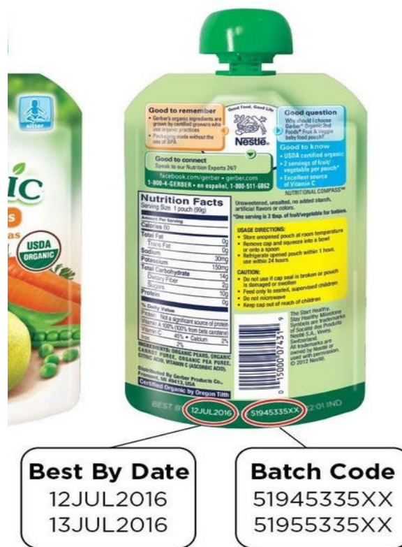
Figure 2. Expiration date and batch code on a food product.