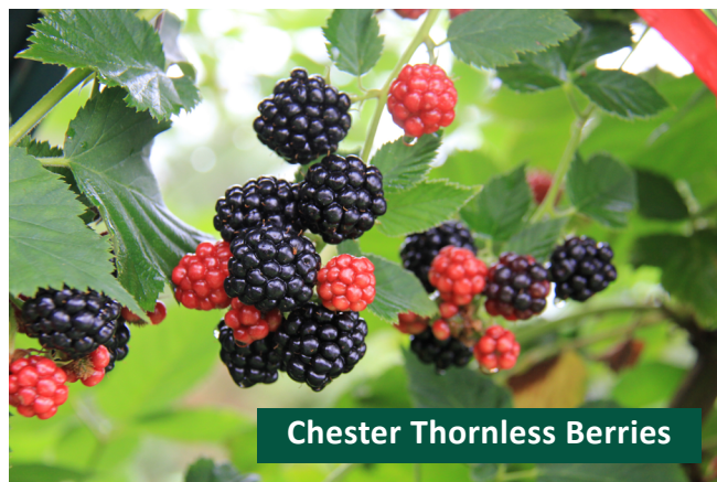
Figure 5. ‘Chester Thornless’ berries in various ripening stages.

There has been an increasing interest in establishing blackberries in Virginia farms. This study findings provide valuable insight, assisting growers with variety selection. For example, growers interested in high yields should consider ‘Chester Thornless’ (fig. 5),