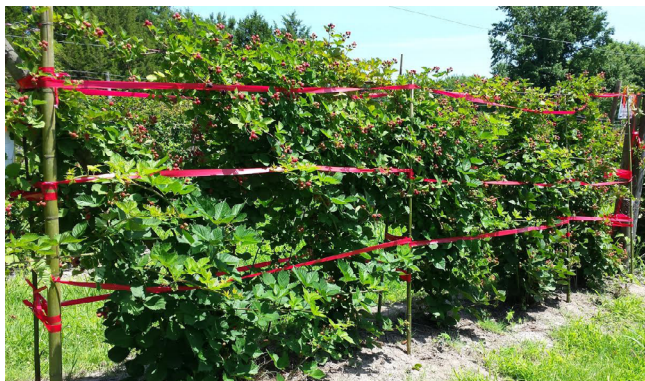
Figure 1. Blackberry subject plants of a single variety were marked to refrain customers from picking berries from which data were collected.

grower practices. Varieties evaluated were Rubus spp. ‘Apache’, ‘Arapaho’, ‘Chester Thornless’, ‘Chickasaw’, ‘Kiowa’, ‘Natchez’, ‘Navaho’, ‘Ouachita’, and ‘Triple Crown’. Seven of these varieties were released by the University of Arkansas; ‘Triple Crown’ and ‘Chester Thornless’ were released by the USDA. The majority of varieties evaluated had an erect growth habit; exceptions were ‘Chester Thornless’, ‘Natchez’, and ‘Triple Crown’, which had a semi-erect growth habit. With the exception of ‘Chickasaw’ and ‘Kiowa’, all varieties had thornless canes. These varieties were trained on a standard T-trellis at all locations. Only ‘Apache’, in Mechanicsville, was trained on two trellis systems, a standard T-trellis and a rotating cross-arm trellis. At each site, data were collected on multiple plants per variety (fig. 1).