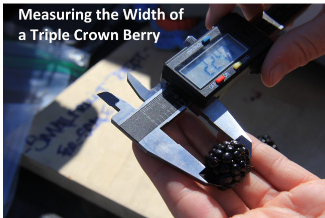
Figure 4. The size of fruit was measured with a vernier caliper scale.